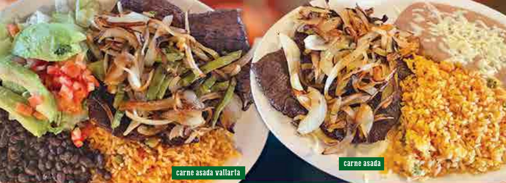
carne asada vallarta