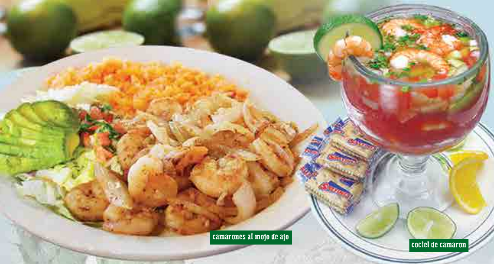
camarones al mojo de ajo