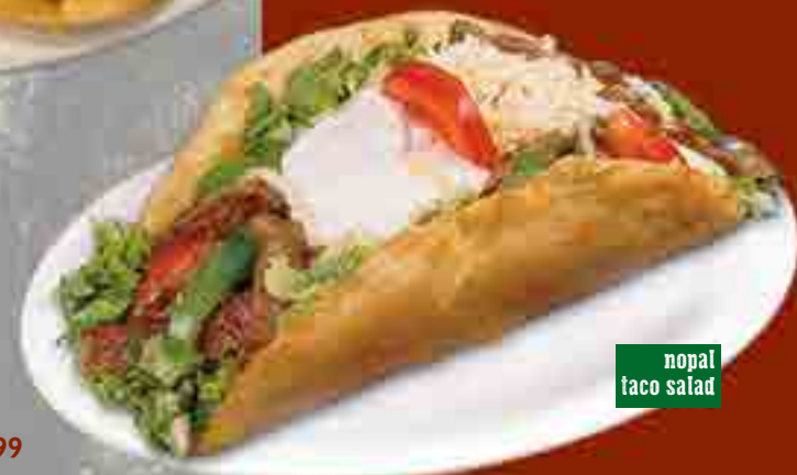
nopal taco salad

SUBSTITUTE CHEESE SAUCE FOR RED SAUCE + 2.99