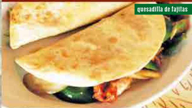
quesadilla de fajitas